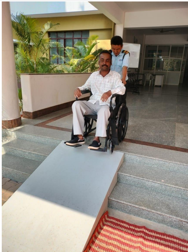
RAMP AND WHEEL CHAIR FACILITY AT MSEC CAMPUS